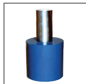
CL 4021 X / 005-A001