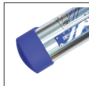
Soft Silicone End Cap for comfort operation.