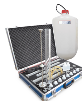
CL 1000 X / 002